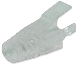
Boot CAT 5e