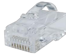
Modular Plug CAT 6