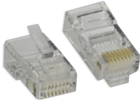
Modular Plug CAT 5e